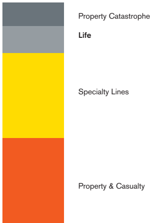
PartnerRe Global Portfolio Split by Business Unit

Our satisfaction is our ability to meet your requirements and needs. We therefore put our financial strength and expertise at your service in the support of your risk, enhancement of your risk and claims assessment, and in the expansion of your product range.