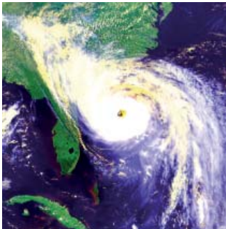
Hurricane Hugo making landfall September 1989

Catastrophe underwriting is increasingly dependent upon sophisticated event modeling to assess and price catastrophe risk. At PartnerRe, we have chosen not to outsource this critical element of the underwriting process, but rather to build our own probabilistic models. Our CatFocus ® earthquake and storm models provide us with an independent view of the risks we are assuming. Where beneficial, we complement the CatFocus ® analysis with that generated by various third party models to arrive at a multi-model assessment.