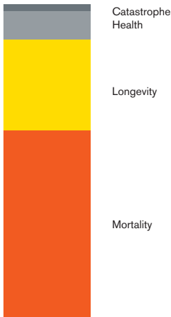
Life Portfolio Split by Segment